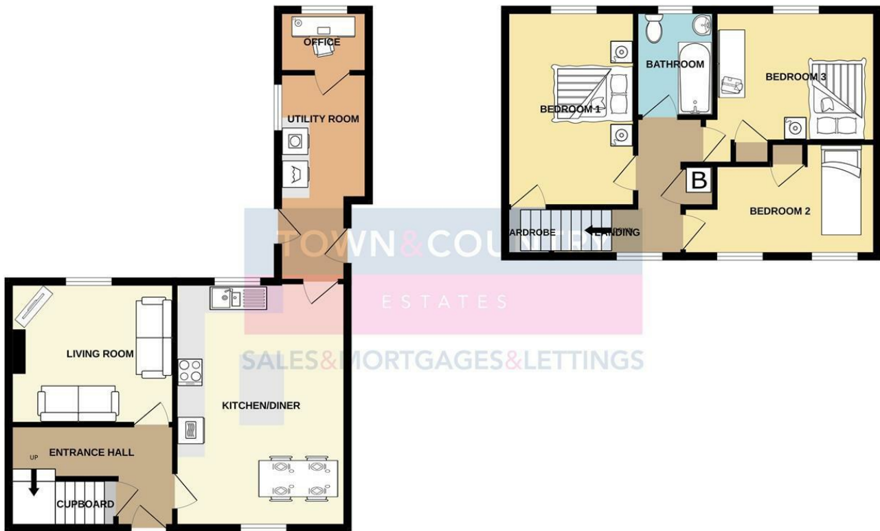
1ST FLOOR 476 sq.ft. (44.2 sq.m.) approx.

TOTAL FLOOR AREA : 1026 sq.ft. (95.3 sq.m.) approx.